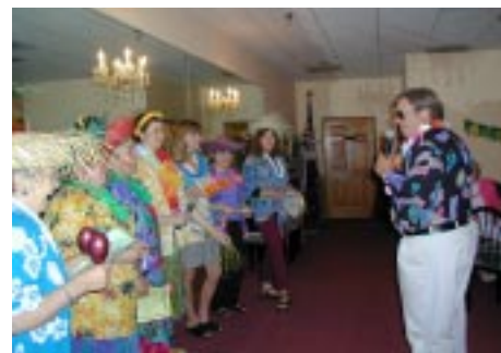
Aloha Means Goodby...Forever