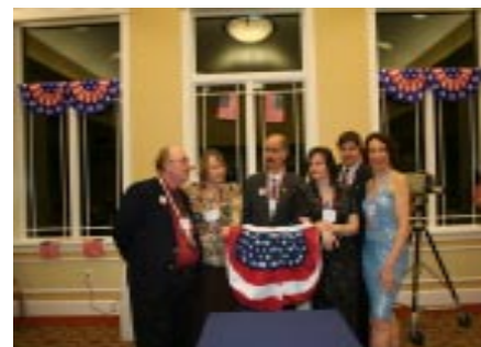
Murder on the Campaign Trail