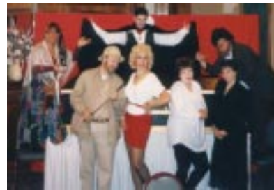
Murder by Moonlight