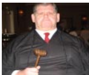
We, the Jury