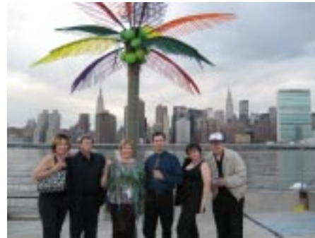
Murder on the Waterfront